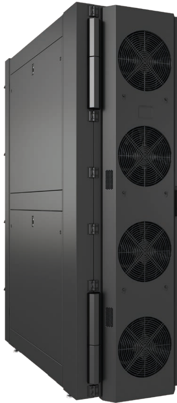
Liebert® DCD50 only available in 800mm width.

By removing the heat at the rack and delivering room temperature air from the rack, the Liebert® DCD eliminates the potential of hot spots being created by the rack, reducing the strain on the whole system.