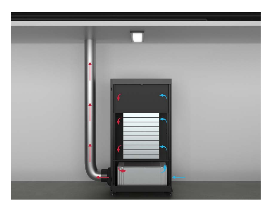
Heat rejected to ceiling plenum

The system's unique design enables fast and easy installation.