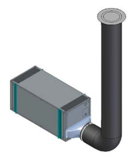
Heat rejection duct kit

The highly flexible Vertiv VRC easily accommodates the many different site challenges presented by small IT spaces. It can be installed to reject heat to the ceiling or an adjacent space.