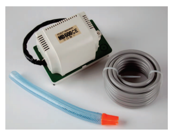
XC-PUMP1 or XC-PUMP2 CONDENSATE PUMP KIT